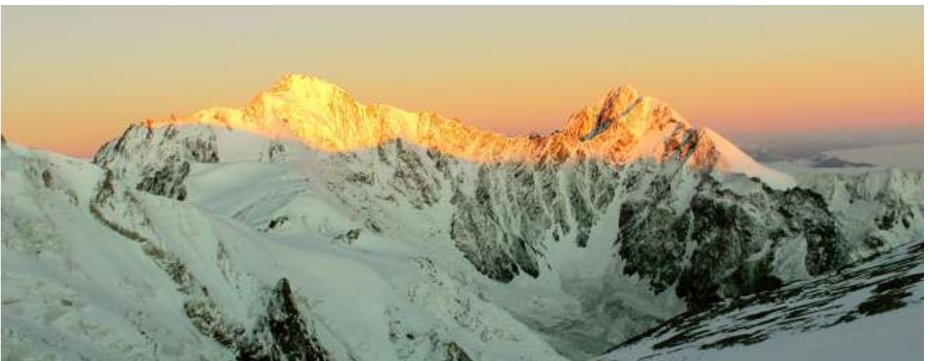
Morning view to Djimara 4780m and Shau-hoh peaks 4638m from Camp2 4150m