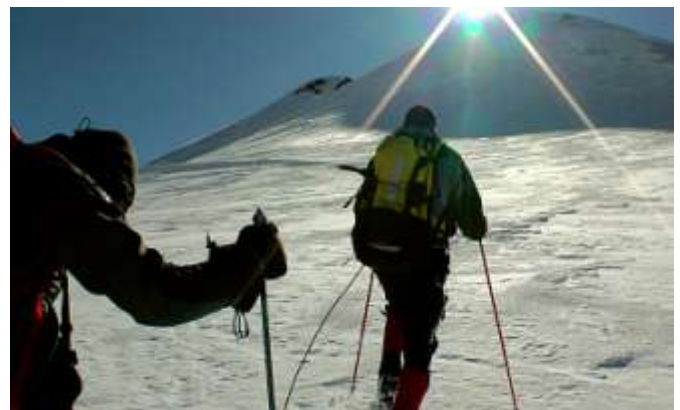
Under Kazbek slope