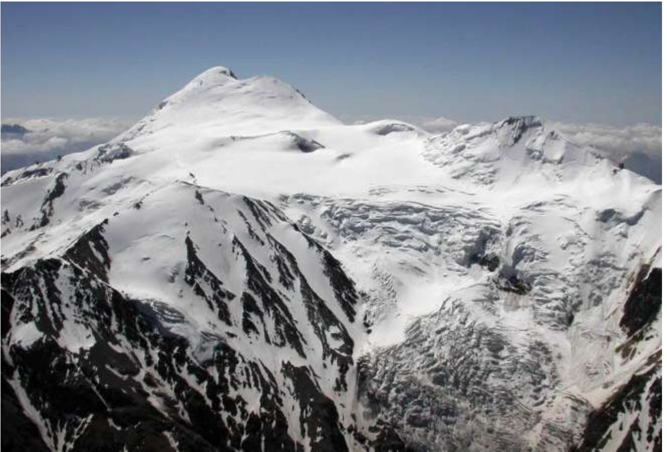
View of Maily glacier and North face Mt.Kazbek

Day 4. Today we have 3-4 hours of climbing way by quite steep (sometimes 60 degrees) stone-covered slope. Some parts of trail are covered by snow (depends at season). There is only 3km of way but we must be concentrated all the time. After some rest time we have 30min. walking to Polyakov peak 4270m. There is great view to Chach glacier (Georgia side) and shapely twin-peaks of Kazbek, which we will hopefully be rewarded with a glowing sunset. Camp2 place 4150m situated on the big stone moraine near the Maily glacier from where we will take fresh water.