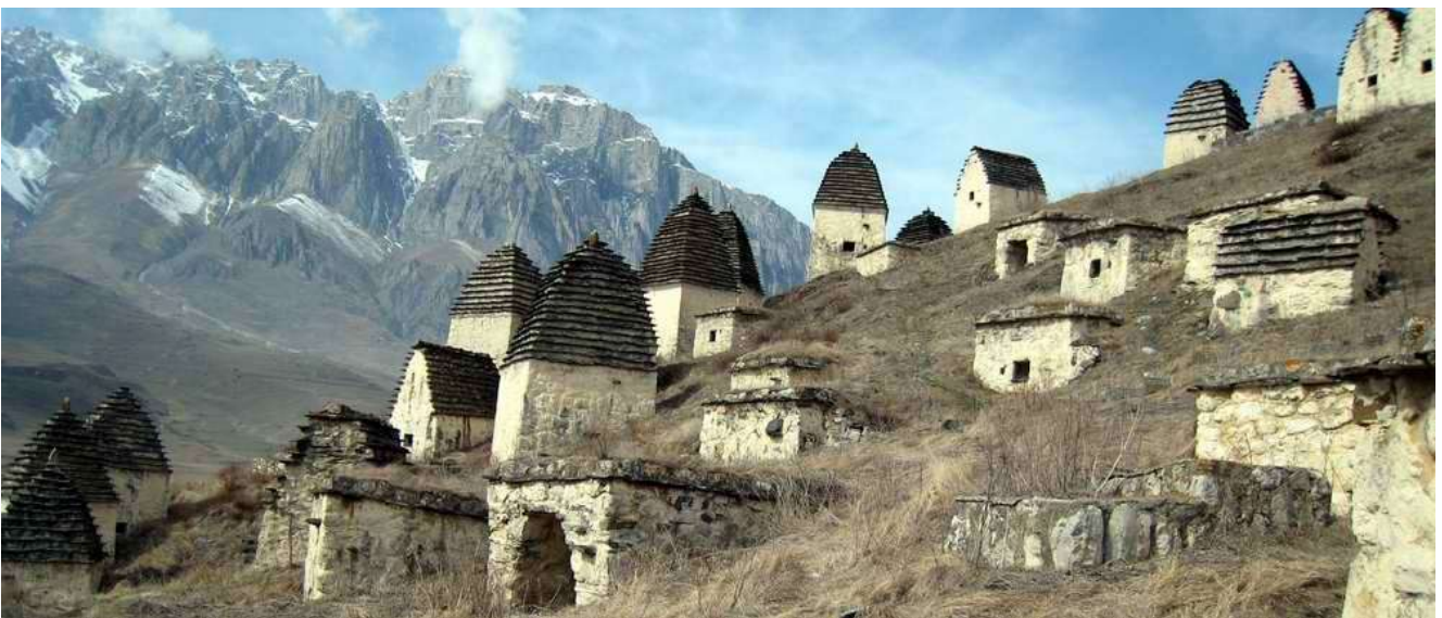
Necropolis of Dargavs city