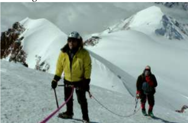
Last pitch before the summit