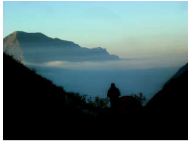
View from Base Camp 2300m

Day 3. Starting at this day all common luggage (tent, food, ropes) will carry by ourselves. We climb up to the start of the Maily glacier (2450 m) through moraine ridge. We must be careful because glacier is open. Sometimes we need to use crampons. There are some steep places after 2770m altitude and maybe we will use fixed rope (approximately 100 meters of way). There is not so steep slope after (average slope of 32 degrees) but we must be concentrating at climbing too. Beautifully-facing Camp1 place at 3400 m, rewarded our hard all-day's work. There is a greatest view to crevasses of Maily glacier and all circuses of mountains with highest point Djimara Peak (4780m) from Camp 1. In evening time we may see lights of Tmenikau village and Vladikavkaz city. Tent camp.