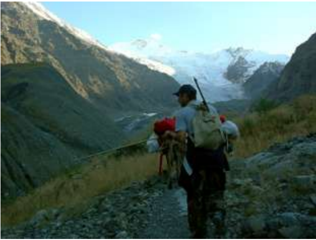
Maily glacier from Karmadon valley