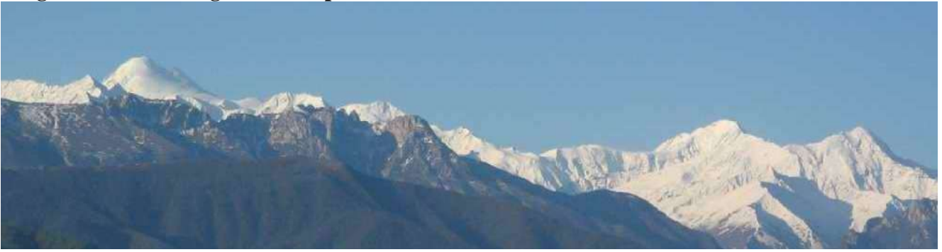
Kazbek-Djimarai, view from Vladikavkaz hotel

Day 1. Flight to Vladikavkaz, arrival. Transfer to Tmenikau village. By the way great views of old families towers and also we are visit the necropolis of Dargavs city (special stone houses city for dead people with pyramidal roofs piled by stone). Tree hours trekking to Base Camp 2300m. Main equipments carry up by mules and we can still travel with light luggage. Close from the Base Camp there are 2 natural hot mineral water springs with bathes. Tent Camp.