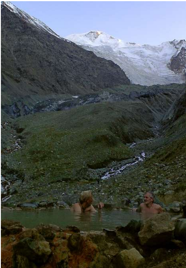
Hot spring in Base Camp