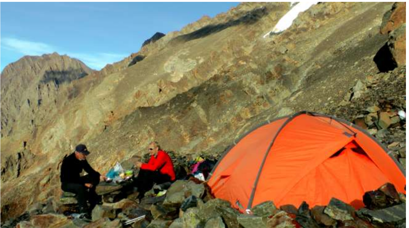
Camp1, 3400 m