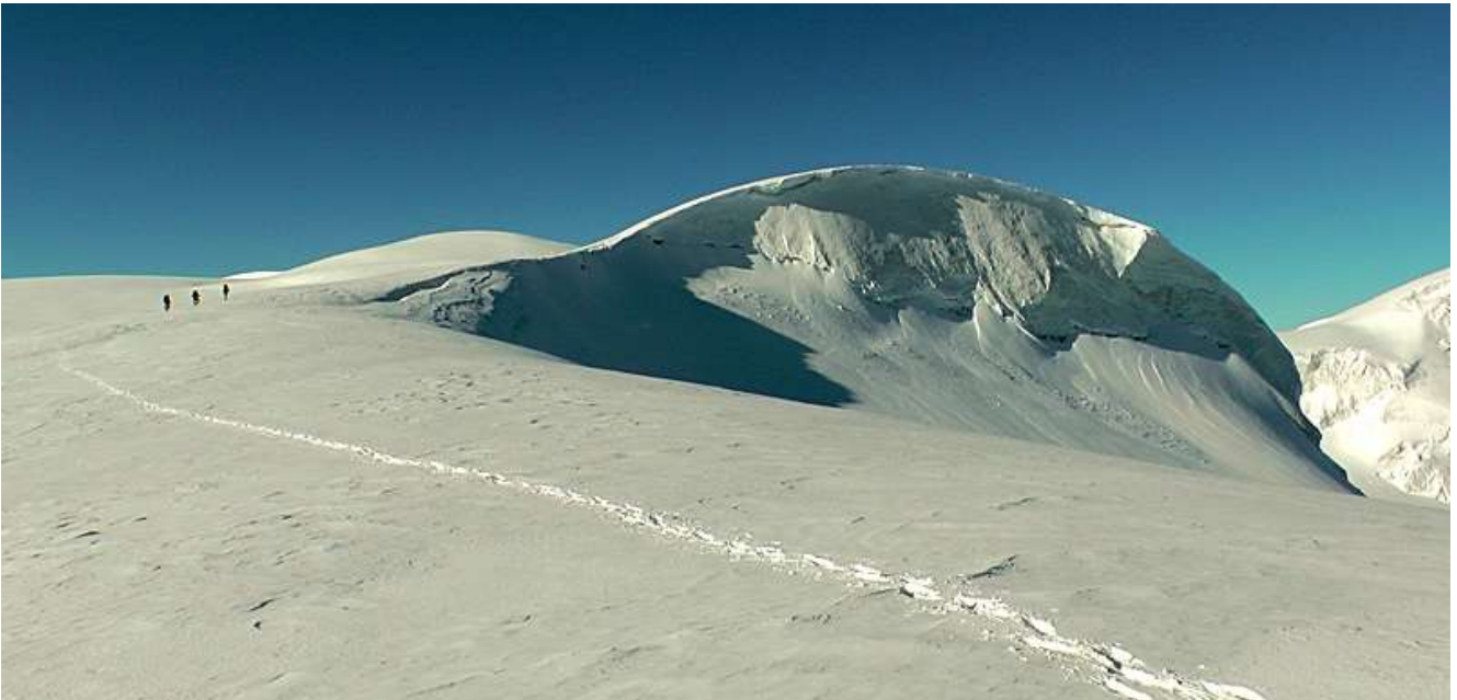
At the top of Maily pass 4400m

Day 5. Summit day! After breakfast inside the tent we take on our harness and crampons. After two hours by Maily plateau we are reached to rocky head of Maily pass 4400m (30 degrees of slope maximum). Perfect view to all Kazbek plateau and our goal for today. Small descent from pass and cross the Kazbek plateau straight to the Kazbeksky pass 4480m. This point brings together Russian and Georgian ascent route, actual summit climb takes place on the exact same route. We still cross a glacier, and after almost 3 hours to reach the "gateway" to the summit. The Mt.Kazbek consists of the small 4890m and the large Kazbek with 5033m. We traverse the back of the small Kazbek along the 30 to 35 degrees sloping ice field (in the snow takes longer) to the saddle direction 4800 m. The last part of slope (10 m high ice / snowdrift) quite steep, where we should go very cautiously. A rest before the final challenge of the very steep and sometimes bare summit ice cap. In the steep ice slope with crampons and partly through rocky passages, we are climbing our final part of way up. Sometimes we need to mobilized all our forces for crossing this ice part(maybe we put a fixed rope) and then it's TOP - the most eastern five thousand meters peak of the Caucasus rewarded us with a wonderful panoramic view of of Central and Eastern Caucasus! At the clean weather we can see another volcano, a giant of the Caucasus - Elbrus (5642 m).